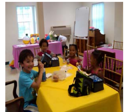
Avatar enjoying lunch with friends.

$75 Early sign-up discount available before August 1, 2009.